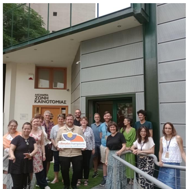
Project training event in Thessaloniki, Greece

The Climate Champions community has been a source of inspiration, collaboration, and friendship. We've come together with a shared goal: protecting our planet. The connections we've formed and the ideas we've shared have been truly uplifting.